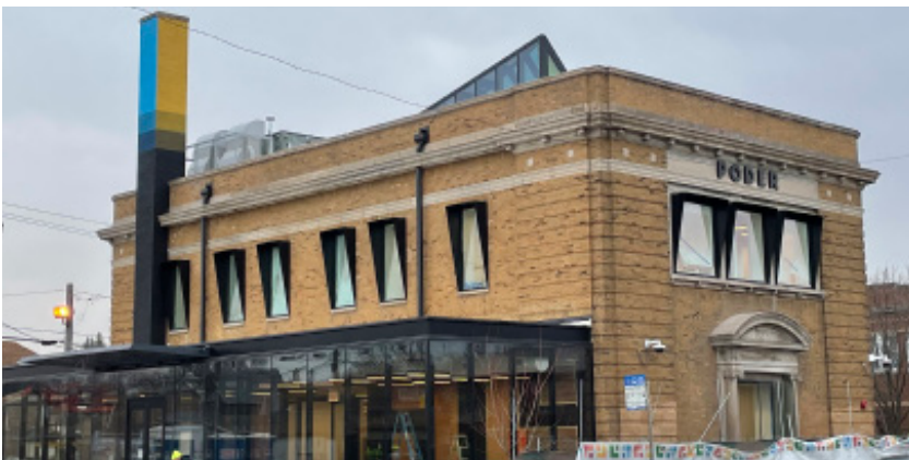
PODER's new HQ in Gage Park will provide ESL classes, job training, and job placement services to immigrant communities.