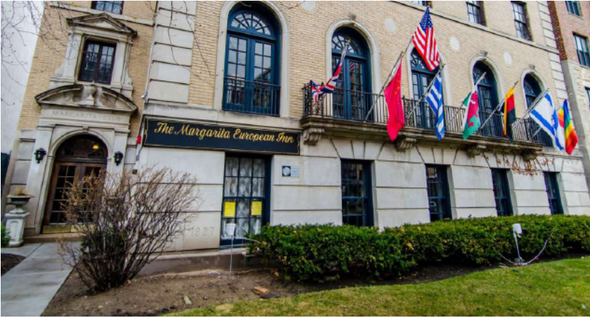
With CVP's help, Connections for the Homeless is converting Evanston's Margarita Inn to non-congregate transitional housing.