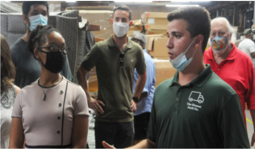
JCUA visits the Chicago Furniture Bank at their expanded new facility in Brighton Park.