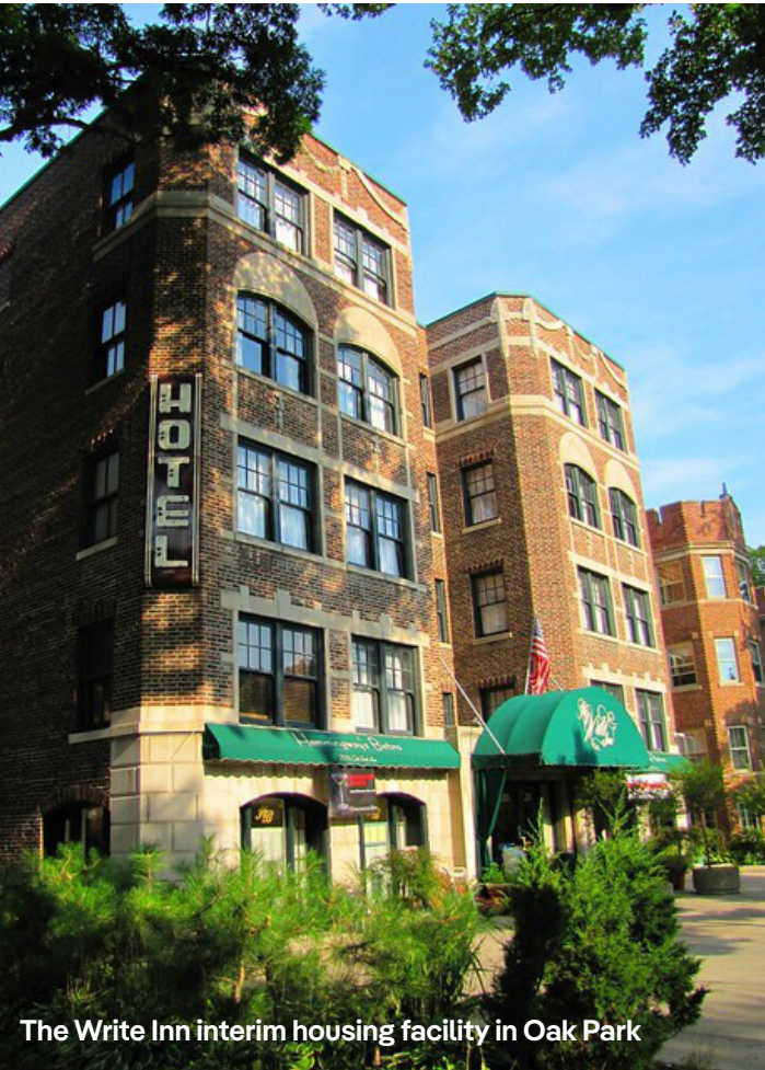
The Write Inn interim housing facility in Oak Park