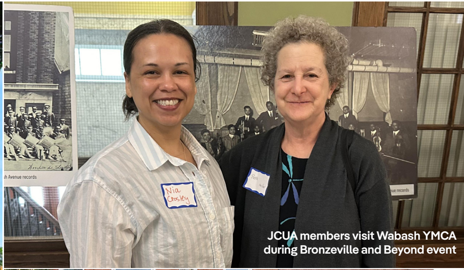
JCUA members visit Wabash YMCA during Bronzeville and Beyond event