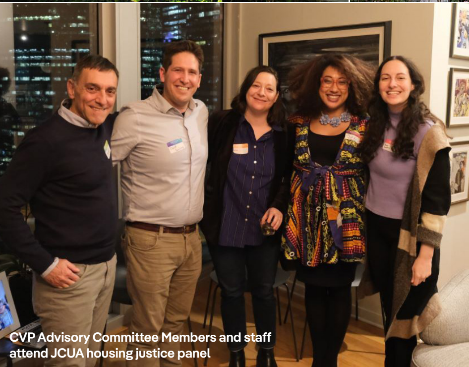
CVP Advisory Committee Members and staff attend JCUA housing justice panel