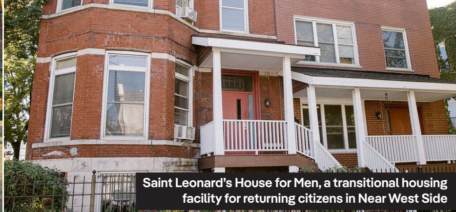
Saint Leonard's House for Men, a transitional housing facility for returning citizens in Near West Side