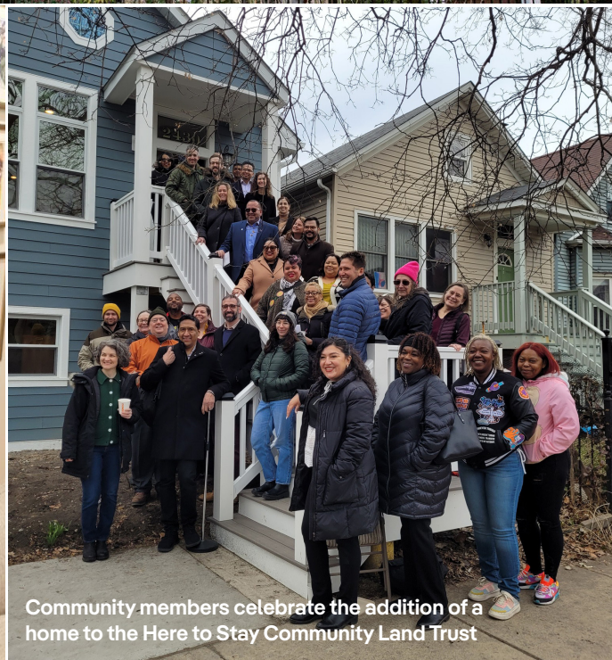
Community members celebrate the addition of a home to the Here to Stay Community Land Trust