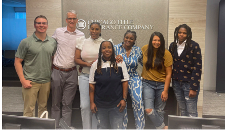
Jumpstart Housing Cooperative

Development of cultural center, mixed-income housing, and business space at former Michael Reese Hospital site*