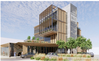
IMAN Health Center

Construction and rehabilitation of 22 affordable rental housing units, including 5 Permanent Supportive Housing units, in Logan Square